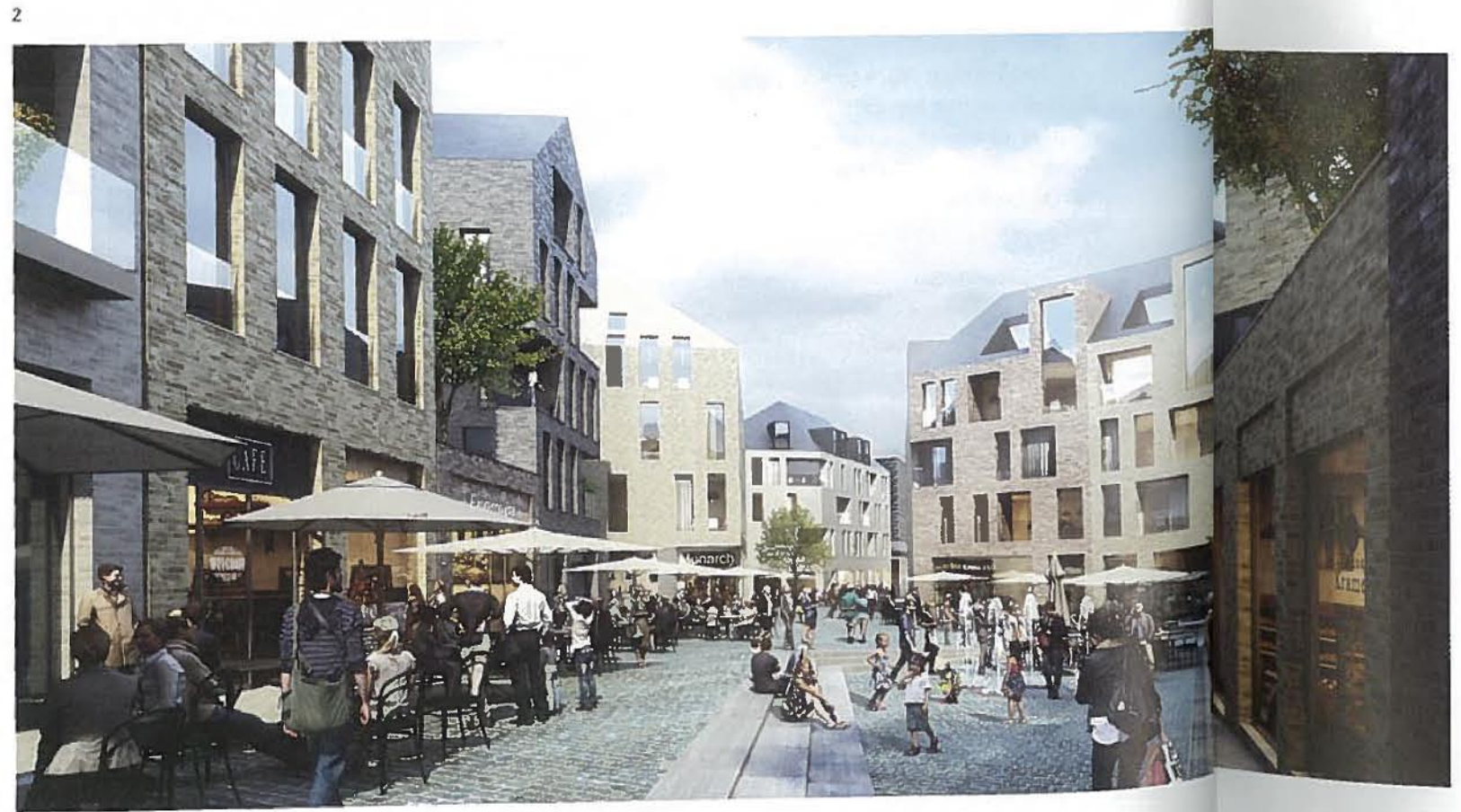
Rendering MACINA digital film GmbH & Co. Kg